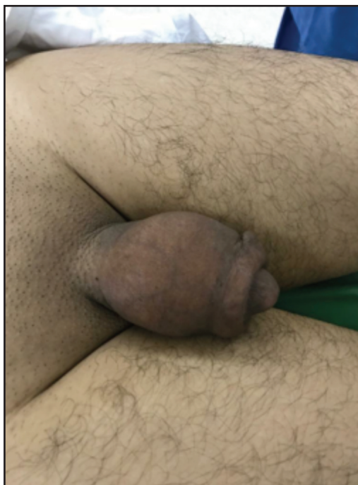
Fig. 1: Massively swollen penis measuring 7cm x 10cm with irregular semi-mobile masses extending into the scrotum.