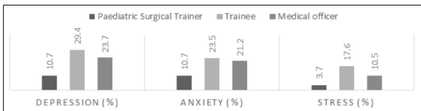
Fig. 1: Prevalence of depression, stress and anxiety among respondents.