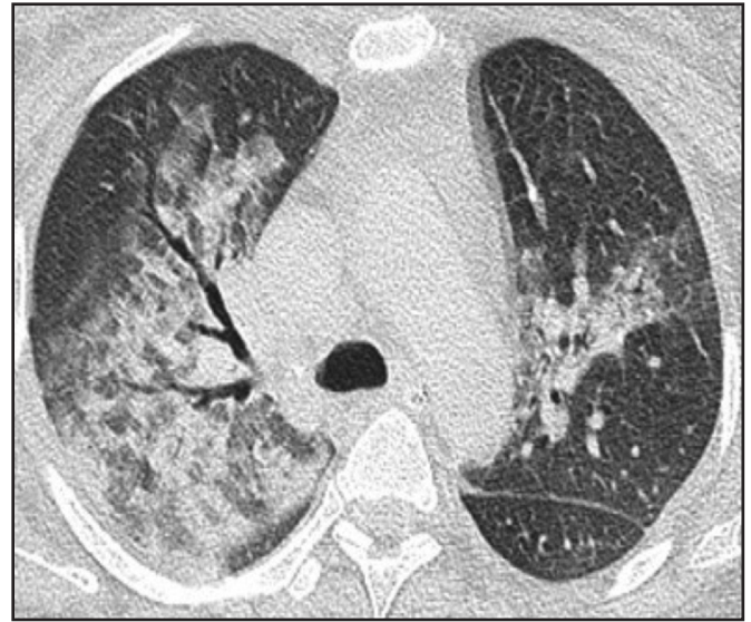
Fig. 2: Computed tomography of the chest on day 11 of illness showed ground glass opacities involving both lungs, but worse on the right.

agar and MacConkey agar. Identification of B. pseudomallei was done with VITEK 2 compact system (BioMerieux, Lyon, France) and antibiotic sensitivity test was performed with Etest. Repeated blood culture was sterile and melioidosis serology (IgM ELISA) was negative. Antibiotics was de-escalated to intravenous ceftazidime in view of clinical improvement on day 20 of illness. Following this, she had an emergency lower segment caesarean section for foetal distress and delivered a preterm baby on day 32 of illness. She completed two weeks of intravenous ceftazidime and was discharged well after five weeks of hospital stay with oral trimethoprim/sulphamethoxazole for another three months. Both mother and child remained well in 2019, two years after discharged.