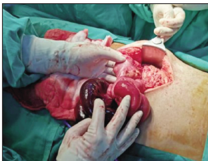
Fig. 2: Intra-operative findings: one loop of the ileum making a knot with an adjacent ileal loop, resulting in obstructed gangrene of the entrapped loop.