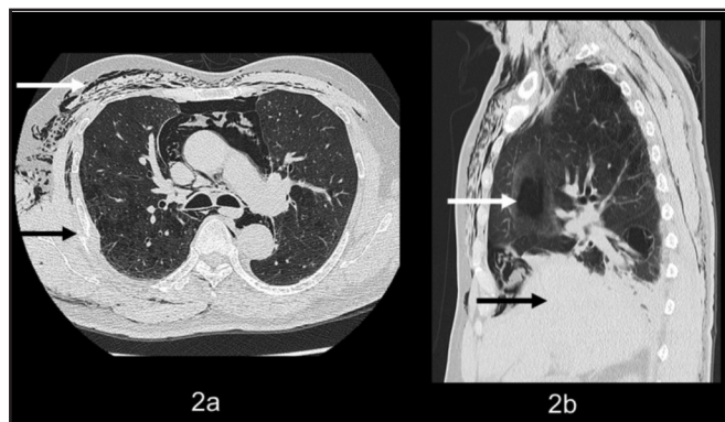
Fig. 2: a) High-resolution computed tomography (HRCT) Thorax showing subcutaneous emphysema (white arrow) and rib fracture (black arrow); b) HRCT Thorax showing bullae over right lung (white arrow) and right lower lung consolidation (black arrow).

pneumothorax. This should raise a high index of suspicion for pneumothorax regardless of inconclusive initial radiological findings. Other imaging modalities which may aid in diagnosis are skeletal scintigraphy and computed tomography (CT) of the thorax, which also help to exclude pathological causes of rib fracture. 2 In the emergency setting, an urgent CT Thorax may be considered depending on the patient’s clinical condition and stability, with the concern to exclude other serious, life-threatening conditions.