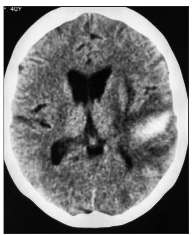
Fig. 2: CT brain showed multifocal intracranial septic emboli (due to location at periphery and grey-white matter junction) and intraparenchymal bleed at left temporoparietal lobe.

A. pyogenes is primarily an animal pathogen, causing pyogenic infections in cattle.1Most human cases are acquired in rural settings with exposure to farm animals. However, our patient had no typical epidemiological exposure. There have been few reported cases of A. pyogenes endocarditis in Europe and Southeast Asia (Table I). Similar to these case reports