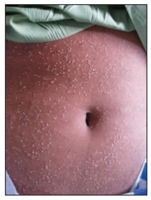
Fig. 1: Amoxicillin-induced Acute Generalised Exanthematous Pustulosis showing characteristic numerous, pin-point, non-follicular pustules on erythematous skin of the abdomen.