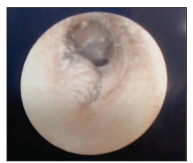
Fig. 1: A soft, hyperpigmented, dome shaped mass at posterior aspect of cartilaginous portion of the right EAC.