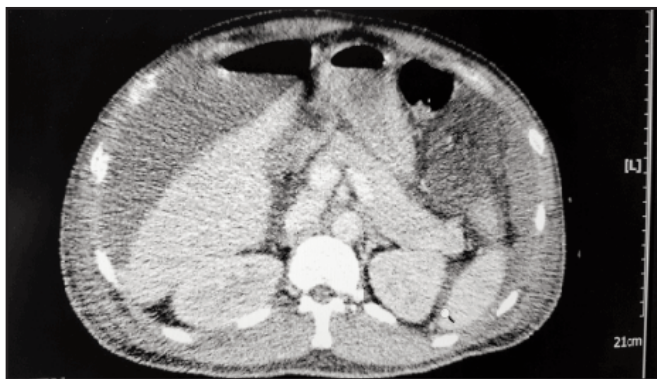
Fig. 1: A Contrasted Enhanced Computed Tomography of the abdomen showed extra-luminal air with ascites forming an air fluid level.