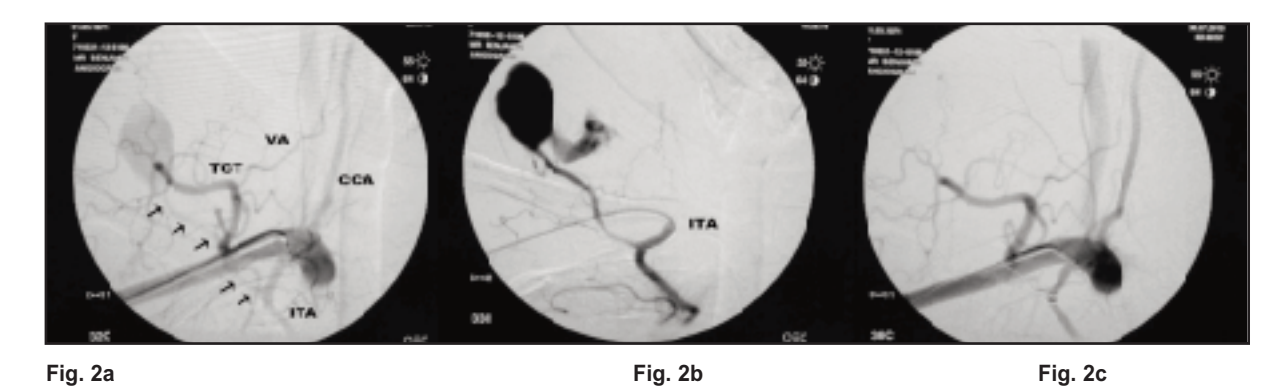
Fig. 2: DSA runs showing (left to right, figure 2a, 2b, 2c), [Fig. 2a], diagnostic run clearly demonstrating a blush in the top-left hand corner, with a feeding vessel (black arrows) arising inferiorly. The right vertebral artery (VA) is seen clearly arising superiorly, and the ITA branching inferiorly. The thyrocervical trunk (TCT) is also seen. [Fig. 2b], after cannulation of the ITA, contrast seen clearly filling the pseudoaneurysm. The feeding vessel is seen branching just after the origin of the ITA from the subclavian artery. [Fig. 2c], successful embolization of the pseudoaneurysm. The coil is seen deployed at the origin of the feeding vessel, and there is no more blushing of contrast.

enhanced CT scan is vital, both for identification of the relevant aetiology as well as delineating the anatomy.<sup>3</sup> Only then can appropriate treatment be administered.