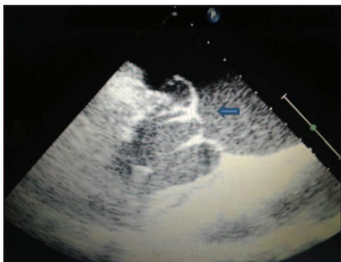
Fig. 2: The trans-thoracic echocardiography in short-axis view showed a mitral valve prolapsed with thickened and billowing leaflet above the plane of annulus (transverse arrow). The chords are elongated.

tract obstruction. 3 He also emphasizes this technique as an important adjunct to establish repair techniques in a patient with a large annulus and excessive leaflet tissue, as seen in our case.