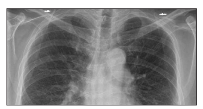
Fig. 2: Chest radiograph showing small notches with sclerotic margins in the supero-medial margins of both scapulae (arrows).

The glenoid cavity, coracoid process, acromion, vertebral border, and inferior angle however remain as cartilaginous centres.