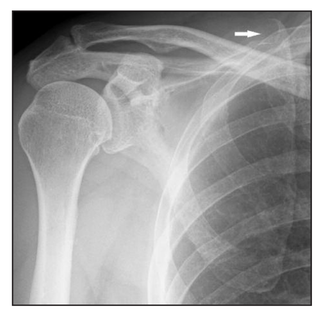
Fig. 1a: Osteolytic area at the supero-medial margin of the right scapula (arrow).