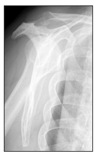
Fig. 1b: Osteolytic area not well visualised in the scapula Y view.