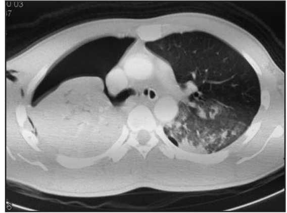
Fig. 2 : Computed tomography scan demonstrating the 'fallen lung' sign suggestive of a major airway injury.