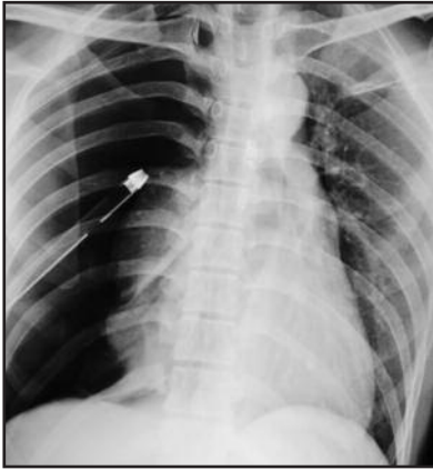
Fig. 1 : Chest radiograph which revealed a completely collapsed right lung.