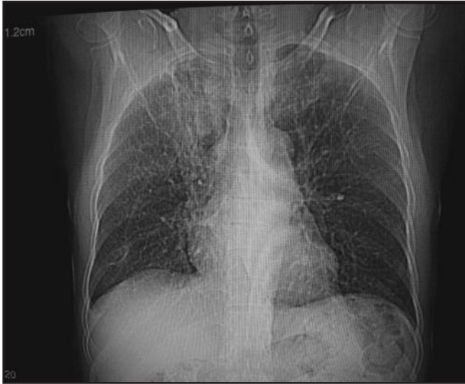
Fig. 1 : CXR - PA view showing right upper lobe non-homogeneous opacity.