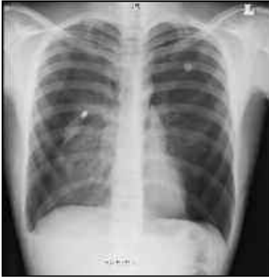
Fig. 1: Chest radiograph (CXR) with simultaneous bilateral spontaneous pneumothoraces (SBSP). Note the existing right ICD. The moderate left pneumothorax was 'missed' on initial presentation.