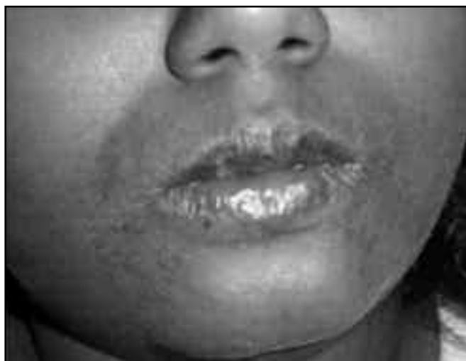
Fig. 1: Generalized blanching erythematous exfoliative maculopapular rash involving her face.