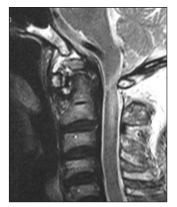
Fig. 2: Sagittal T2 MRI showed altered signal at C1 level which compatible with chronic oedema or myelomalacia.The cord changes are primarily due to the impingement by the posterior arch of C1.

laxity due to disturbances in the blood supply to the developing bone as a result of inordinate mobility <sup>5</sup>. In contrast, trauma is a relatively uncommon cause of such instability, and the pathomechanics are reported to be due to flexion, distraction and rotation