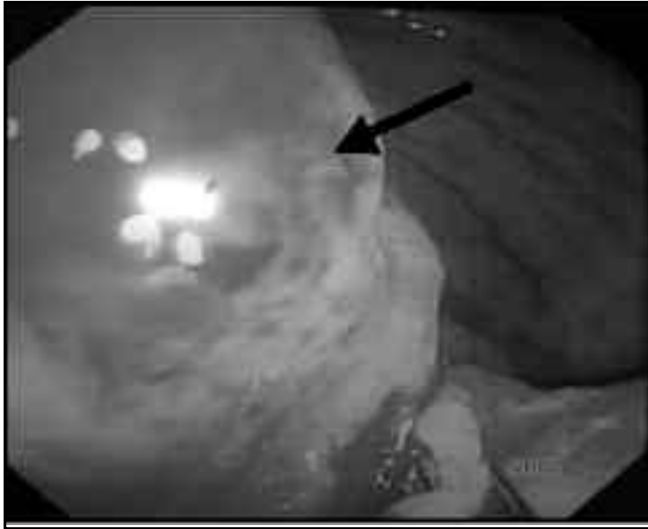
Fig. 1: Colonoscopy image shows external compression onto caecum with regular and smooth mucosa of the caecum (black arrow).