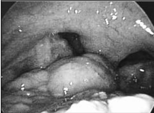
Fig. 1: The sessile mass seen on protrusion of the tongue, flanked by the grade 3 tonsils.