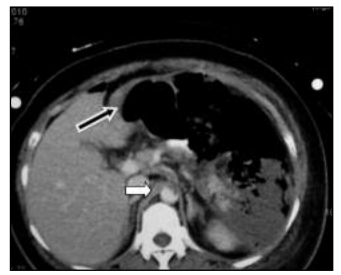
Fig. 1: CT Abdomen with contrast(oral &IV) showing celiac artery thrombosis (white arrow) and pneumoperitoneum (black arrow)