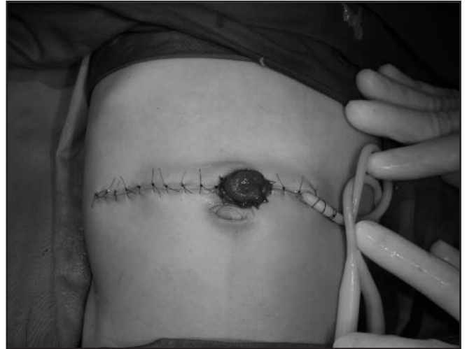
Fig. 2: The duodenal controlled fistula and distal mucous fistula.

age were victims of non-accidental trauma. Thus, non-accidental injuries should be suspected, especially when there were other signs of abuse, when an infant is diagnosed with duodenal perforation.