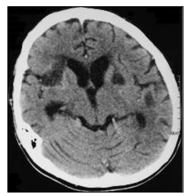
Fig. 3: Six weeks post treatment.

was negative. Serum galactomanan antibody was also negative. His condition improved dramatically within the next few days and a repeat CT scan at 2 weeks and 6 weeks later (Figure 3) showed marked improvement. He was discharged 2 months after admission with prednisolone 30mg od and hydroxychloroquine 200mg od. He completed 2 months of anti-toxoplasma treatment and was continued on trimethoprim-sulphamethoxazole (TMP-SMX) prophylaxis.