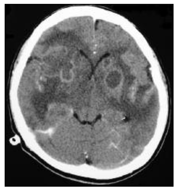
Fig. 2: Multiple ill-defined ring enhancing lesions of varying size in both basal ganglias, right frontal and left parietal lobe.

was negative. Serum galactomanan antibody was also negative. His condition improved dramatically within the next few days and a repeat CT scan at 2 weeks and 6 weeks later (Figure 3) showed marked improvement. He was discharged 2 months after admission with prednisolone 30mg od and hydroxychloroquine 200mg od. He completed 2 months of anti-toxoplasma treatment and was continued on trimethoprim-sulphamethoxazole (TMP-SMX) prophylaxis.