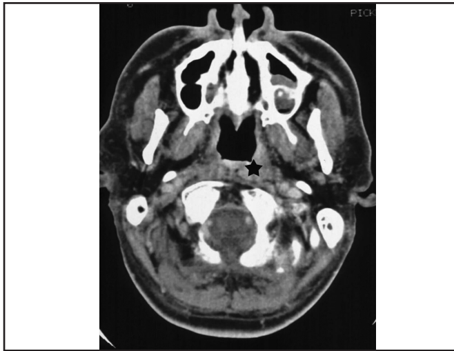
Fig. 1: CT scan showing recurrent nasopharyngeal tumor (rT1 N0 M0) in the left nasopharynx of Case study 1.