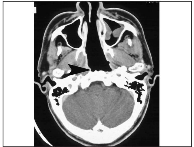
Fig. 2: Post-operative CT scan of Case study 1. The posterior wall (arrow) has been resected down to bone and the left Eustachian tube has been transected at the torus tubarius.