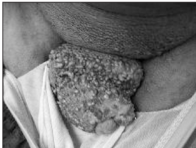
Fig. 1: Multiple angiokeratomas seen on the scrotum and penis.

A 24 year old Iban man was referred for multiple papular lesions on the scrotum, penis, buttock and both thighs and legs since childhood. He also had gum bleeding, occasional episodic acral paraesthesia and bilateral pedal oedema for the past few months. There was no history of anhidrosis, angina, visual impairment, abdominal pain, bone pain, fever or reduced effort tolerance. He is mentally challenged and currently unemployed. He is independent on his activities of