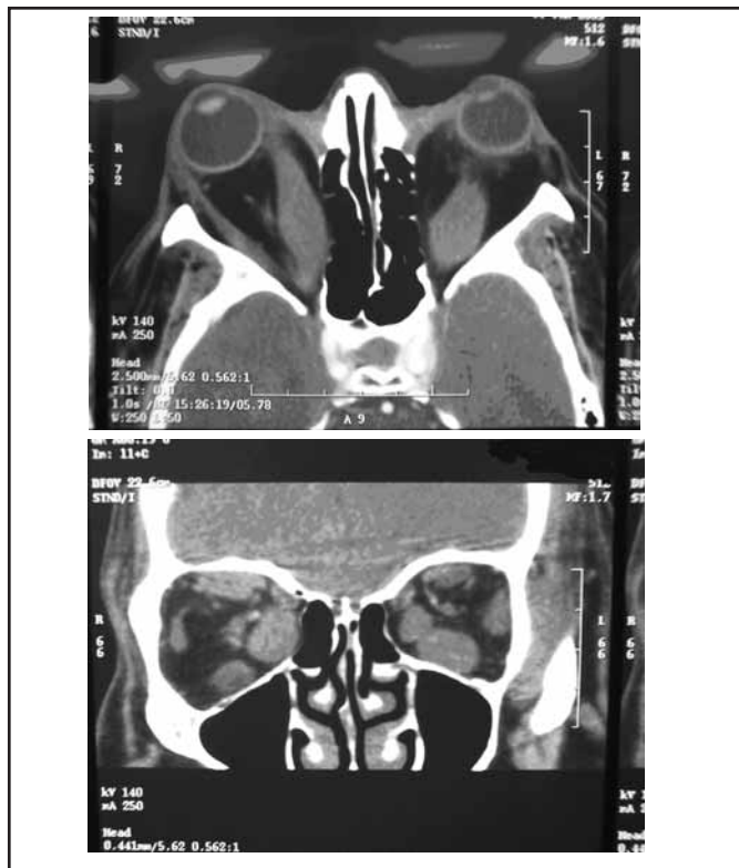
Fig. 1: A computed tomographic scan of the orbits demonstrated bilateral proptosis more in the right eye than left eye with thickening of superior, inferior and medial recti muscles. Axial (up) and coronal (down) views.

Surgical orbital decompression for Graves’ ophthalmopathy has traditionally been performed via transantral approach (The Walsh-Ogura decompression). However, this technique provides poor access to the posterior lamina papyracea and this may be inadequately removed. In addition the fovea ethmoidalis is also approached obliquely making it vulnerable to injury and generous Caldwell-Luc antrostomy results many complications too 1 . The advent of intranasal endoscope has significantly improved anatomic visualization of the nose and paranasal sinuses. This has allowed for a transnasal decompression of the medial and inferior orbital walls that compared well with traditional methods. Endoscopes also permit a maximal posterior orbital decompression at the orbital apex, an area often not fully accessible via transantral routes. This provides optimal decompression of the optic nerve in cases of optic neuropathy. Endoscopic visualization of the medial orbital wall is superior to either the transantral or external ethmoid approaches, thus permitting a more complete medial orbital decompression. The anterior portion of the orbital floor is inaccessible through the maxillary ostium. Thus, a significant anterior buttress of orbital floor remains that supports the globe and it is unusual to see any significant inferior orbital displacement 1 .