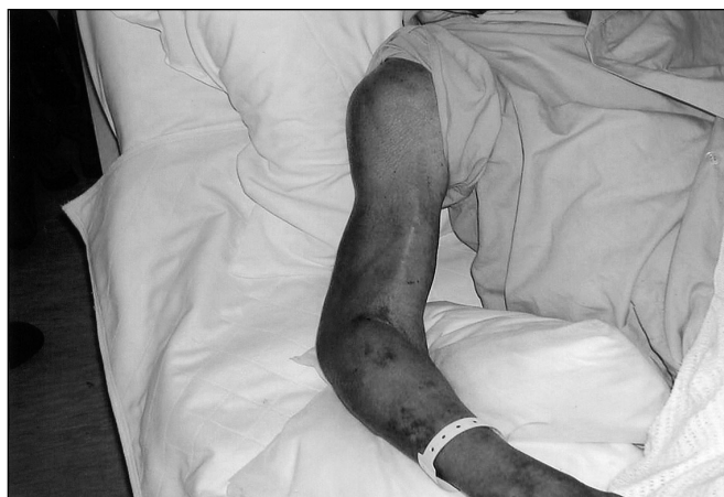
Fig. 2: "Shoulder pad sign"