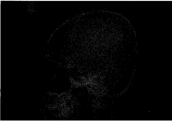
Fig. 1: Plain radiograph of the skull showing the foreign body located at the floor of the maxillary sinus.