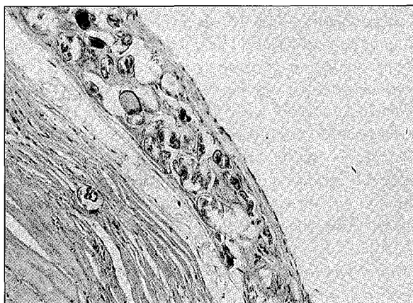
Fig. 2: Scarring granuloma with the egg in the nidus in fibrotic cyst wall. H & E x 200