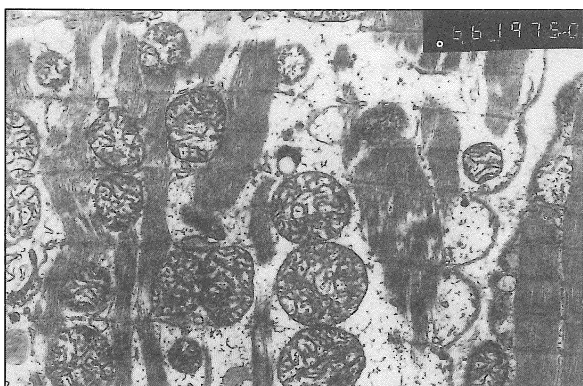
Fig. 2: Myocardial ultrastructure after 30 minutes' reperfusion in Subgroup 2B (x 9900).