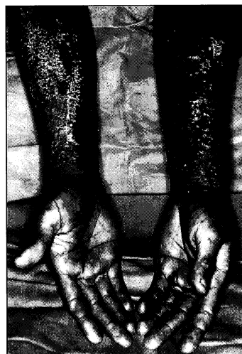
Fig. 2: Grouped erythematous papules and vesicles on the upper limbs of the patient with Herpes Gestationis