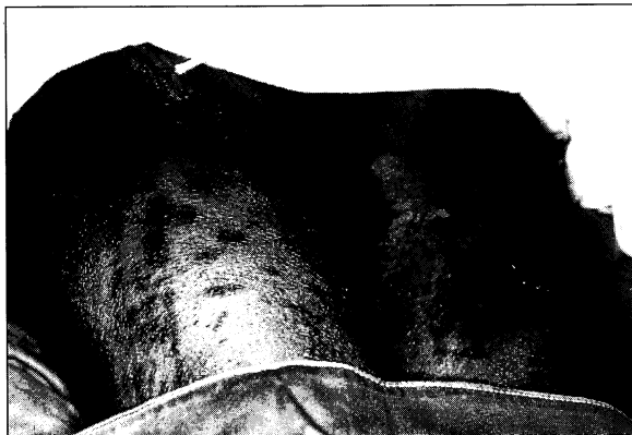
Fig. 1: Erythematous papules and areas of frank urticaria on the thighs of the patient with Herpes Gestationis. Skin biopsy site is noted

The initial lesions are erythematous or oedematous papules, vesicles or urticarial plaques. The distribution of the lesion is widespread and symmetric. As these lesions progress they develop erosions and crusts. The diagnosis of HG is based on the demonstration of linear deposits of the third component of complement along the basement membrane zone (BMZ) of normal