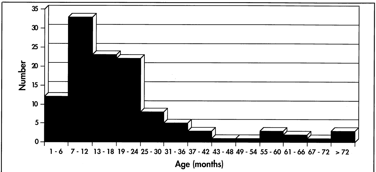
Fig. 1: Age at presentation

In 114 patients, the duration of fever prior to onset of seizure ranged from 0 to 168 hours and the mean was 16.5 hours (SD=21.3 hours). In the remaining three patients the parents gave a history of fever prior to onset of the febrile seizure but were unable to remember the duration of fever.