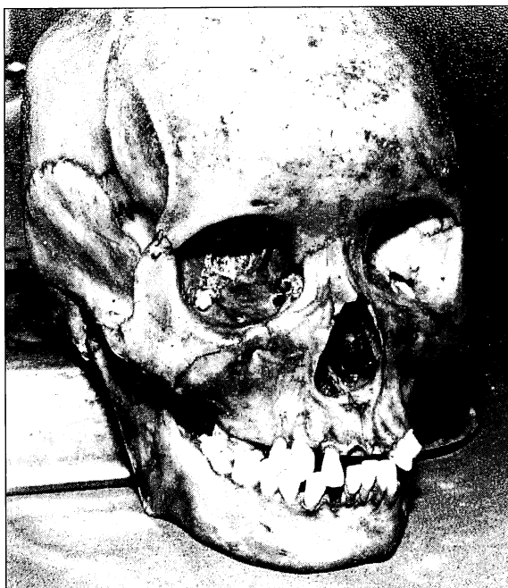
Fig. 2a Characteristic spacing distal to the right upper lateral incisor and the lower canine. The other front teeth have been lost postmortem and not recovered at the site of discovery of the body.