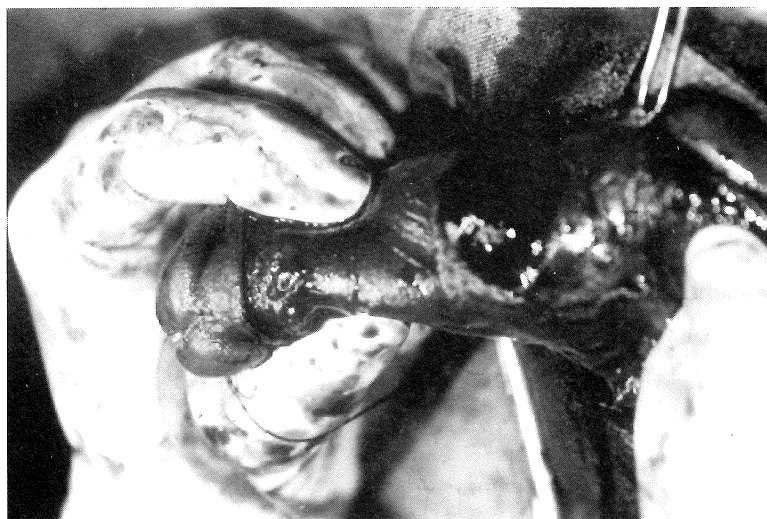
Fig 1: Shows the haematoma over the site of fracture after degloving the penile skin.