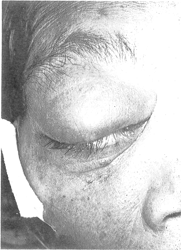
Fig. 2 : Shows right periorbital cellulitis