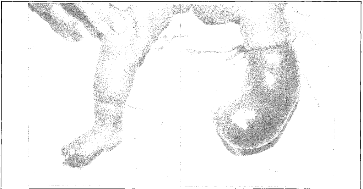
Fig. 1 Bilateral ring constrictions with gangrene of the left leg.

of the subcutaneous tissue. The bones of the left leg and foot were otherwise normal; the ossification centres were consistent with age. An X-ray of the right leg showed a similar ring constriction at the same level. The tarsal and metatarsal bones were normally ossified consistent with age. The great toe showed only the proximal phalanx and this was shorter than normal. The second toe showed only a proximal phalanx of normal length and shape.