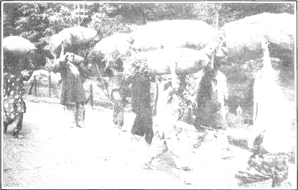
Fig. 1 Kashmiri women loaded with heavy bundles of fire-wood return home in the evening. Unless such women receive social, moral and technical support, the burden of child care can be overwhelming.

need to mobilise village health workers. Not only will these villages' health workers be a direct source of health care, but they will serve as an invaluable support for the millions of mothers who will be mobilised as focal points of child health. These mothers will need reassurance and social support from village health workers. Armed only with a few weeks of training and a few inexpensive items of equipment, village health workers can provide the knowledge and technology to help families enhance the health of their children (Fig. 2). Supported by the community, backed by referral services from health centres and hospitals, the element of primary health care will have to been set up.