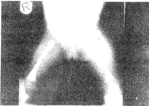
Fig. 1 On admission A/P view both hips showing slight lateralization of proximal end of (L) femur.