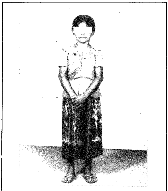
Fig. 1 The patient, 23-years-old showing height of 128 cm and weighing 31 kg.

V.K. Mathews, MBBS (Mal), MRCP (UK) Consultant Paediatrician General Hospital Kuantan Pahang, Malaysia