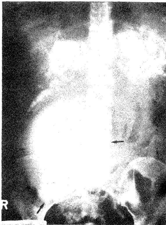
Fig. 2 Percutaneous transhepatic cholangiography showing a large choledochal cyst.

Choledochal cyst was first described by Douglas in 1852. 3 Choledochal cyst is a cystic dilatation of the bile duct commonly seen in younger age