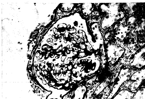
Fig. 1 A glomerulus from the first biopsy showing moderately advanced membranous nephropathy. It is normocellular with uniformly thickened capillary walls showing typical epi-membranous 'spikes' (arrow). Silver methanamine x 400.

The first renal biopsy specimen (Fig. 1) examined by light microscopy contained only 4 glomeruli of which 1 was sclerosed. The remaining 3 glomeruli revealed what appeared to be typical membranous nephropathy. The glomeruli were normocellular with no significant increase in mesangial matrix. The capillary loops were uniformly thickened with numerous epimembranous 'spikes' on silver stain, the over-all appearance corresponding to a stage II membranous lesion in the system of Ehrenreich and Churg (1968). The surrounding parenchyma was generally well preserved with small foci of tubular atrophy and lymphocytic interstitial infiltrates.