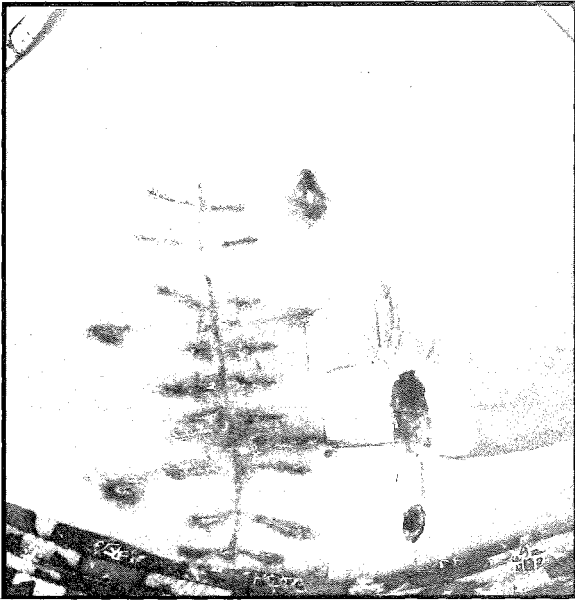
Fig. 1. Application of a large piece of wafer surrounding the entero-cutaneous fistula to prevent skin excoriation.