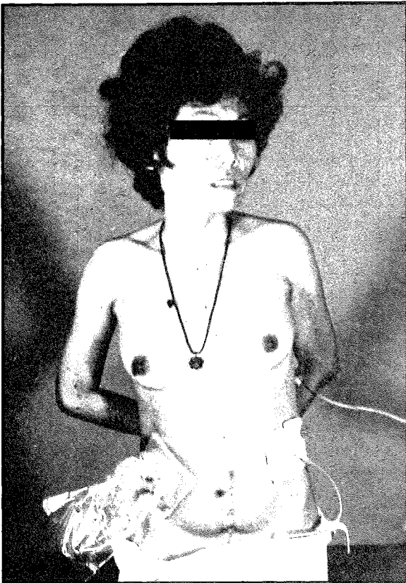
Fig. 3. The use of a stoma-adhesive and bag for collection of discharging fluid from an entero-cutaneous fistula.