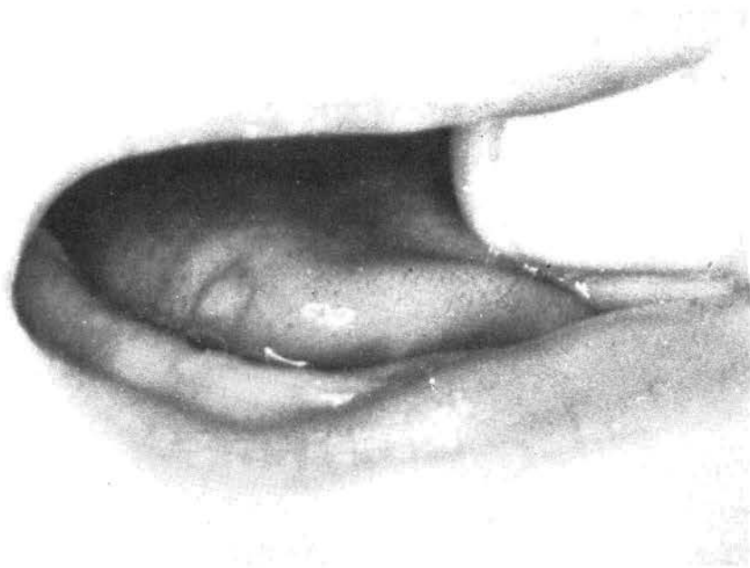
Fig. 1. Note the healing ulcer on the right side of the tongue. The photograph was taken on the 8th day by which time the ulcer on the upper gum margin had healed.