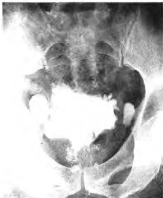
Figure IV(a) shows (1) Marked prostatic enlargement as evidenced by indentation at bladder neck and elongation of supra-collicular urethra as the enlargement of the prostate is proximal to the colliculus (Middlemiss 1952) and (2) Trabeculated and thick-walled bladder with bladder diverticula giving a "Mickey Mouse" appearance.