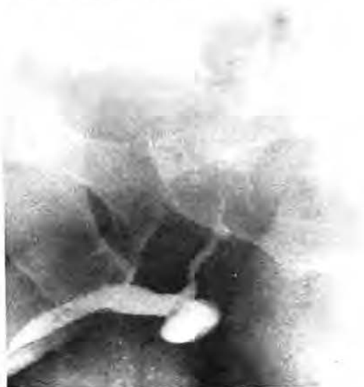
Figure IV(b) shows (1) A short stricture at the membranous urethra, and (2) A false passage with periurethral extravasation due presumably to previous dilatation. The patient gave a history of dysuria and urethral discharge nine years previously following contact with venereal disease. Six years ago, he had two episodes of acute retention of urine. Urethral dilatation was carried out at a district hospital on each occasion with relief of symptoms. He was admitted to the University Hospital with another acute episode of retention of urine. The above ascending urethrogram was done followed by dilatation of the urethra and trans-urethral resection of the prostate. The patient voided well after this.