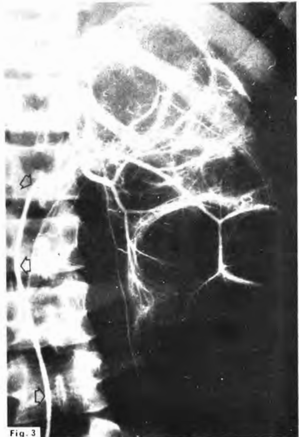
Fig. 3: Selective renal arteriogram in a patient with non-functioning hydronephrotic left kidney. Arrows indicate the three curves of catheter.

the catheter would intersect at an angle of 90 degrees if projected.