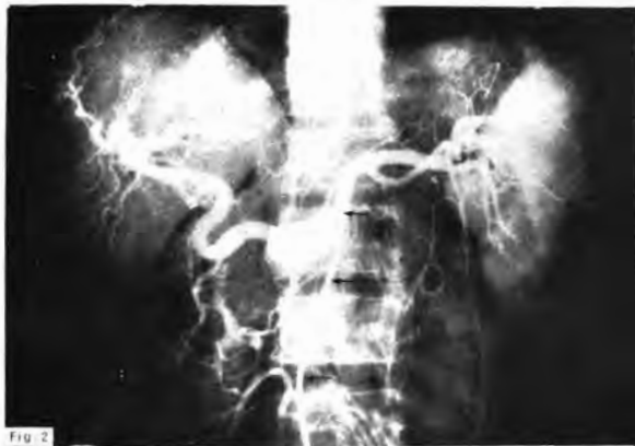
Fig. 2: Coeliac axis arteriogram performed for suspected hepatoma in a patient with cirrhosis. Arrows indicate the three curves of catheter.