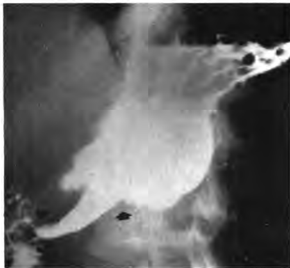
Fig. 2: Barium meal 28 days after acute injury shows the stenosis and complete absence of mucosal folds in the antrum (arrows).

The selective damage by acid on the distal stomach is related to its rapid passage down the oesophagus and along the lesser curvature. The normal alkalinity of the pharyngeal and oesophageal mucosa tends to neutralize weak acids. However, when the corrosive reaches the antrum and pylorus, tetanic contractions