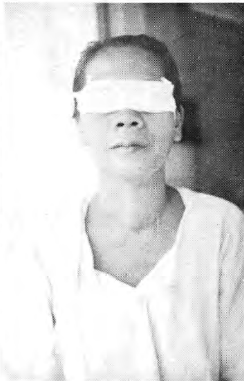
Nodular Goitre. Woman aged 34 years.