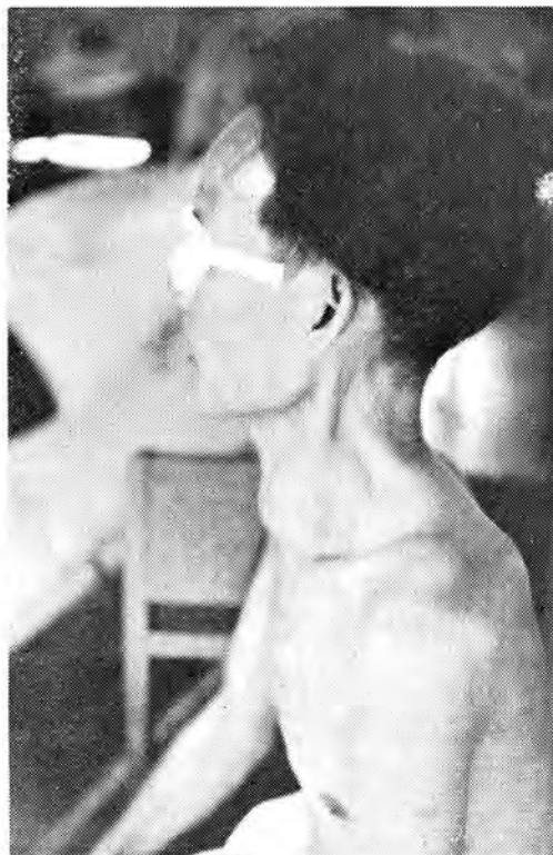
Cancer Thyroid gland. Man aged 57 years.