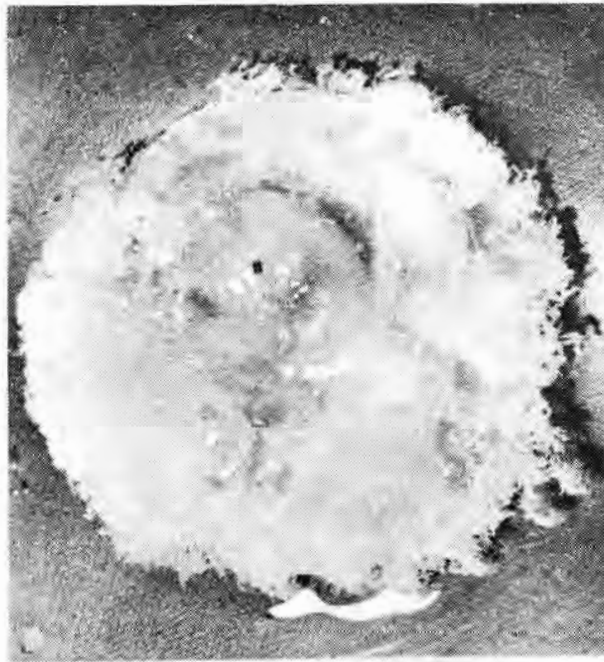
PHOTOGRAPH NO II

The uterus was found to be retroflexed and retroverted, and enlarged of ten weeks size. It was flattened antero-posteriorly, and soft and flabby in feel. Hysterotomy was decided upon as the signs and symptoms of inevitable abortion were apparent. Products of conception were removed and a foetus of ten weeks size in an intact amniotic sac was found. Uterus was sutured in layers.